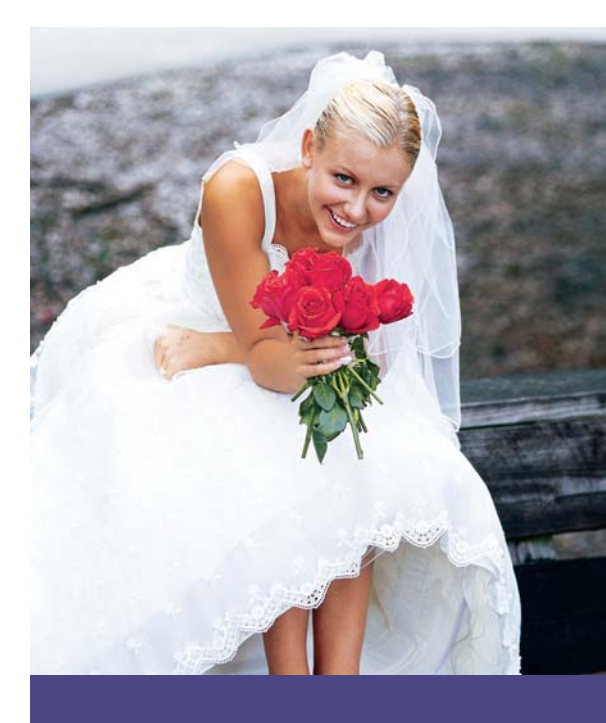
EXQUISITE ADORNMENTS, INDULGENT PAMPERING